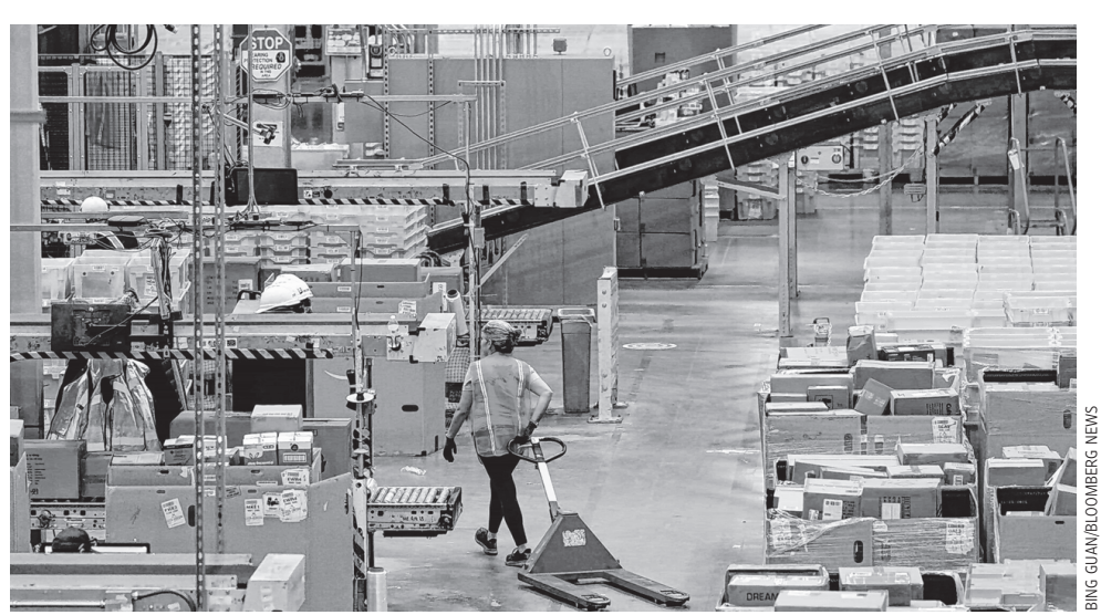
The union contract being negotiated is for Amazon's delivery drivers and warehouse workers.