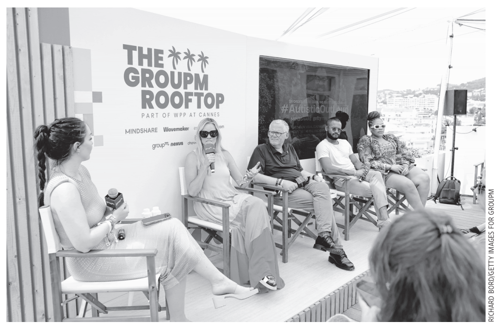
GroupM, a WPP unit, previously forecast global ad spending would hit $1 trillion in 2025.